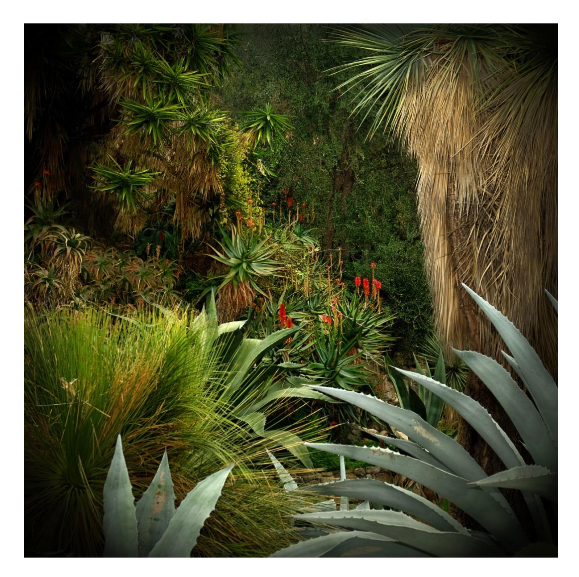
Jungles 3, Tirage Fine Art, 100 x 100 cm, 2013, Ed. 5.

Exploring imaginary lands, Olivia Lavergne endeavours to blur all geographical references to transport the viewer into a fictional space that has been totally transformed by her lens and by the subtle devices that she implements. In her series Jungles , the viewer is immersed in a tropical forest with a fascinating luxuriance and strange beauty beckoning to be explored.