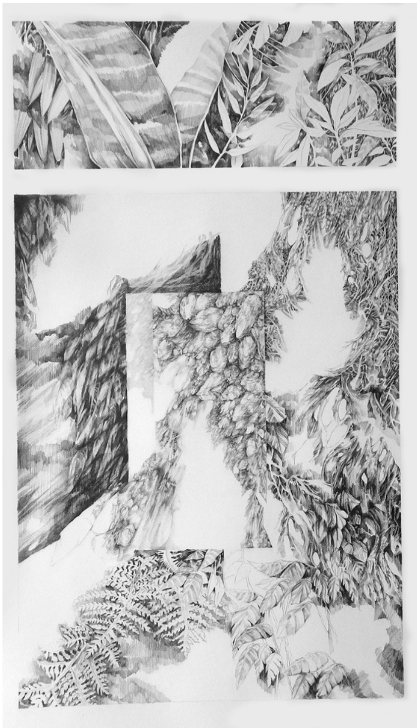
Sous-viens, graphite on paper, 120 x 74 cm, 2020