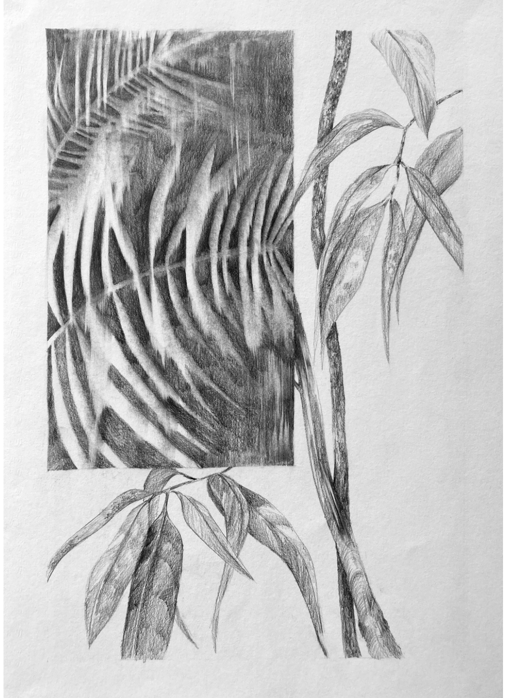
Emergence 19 , graphite on paper, 42 x 29,7 cm, 2022