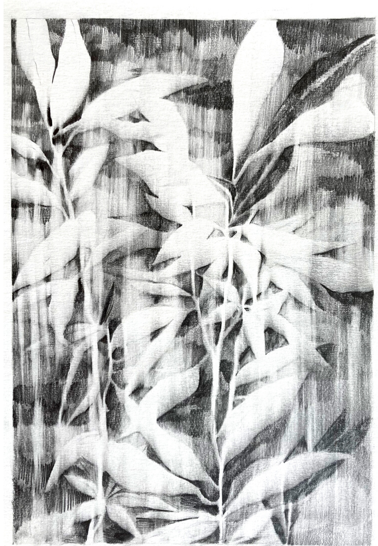
Emergence 7, graphite on paper, 29,7 x 21 cm, 2021