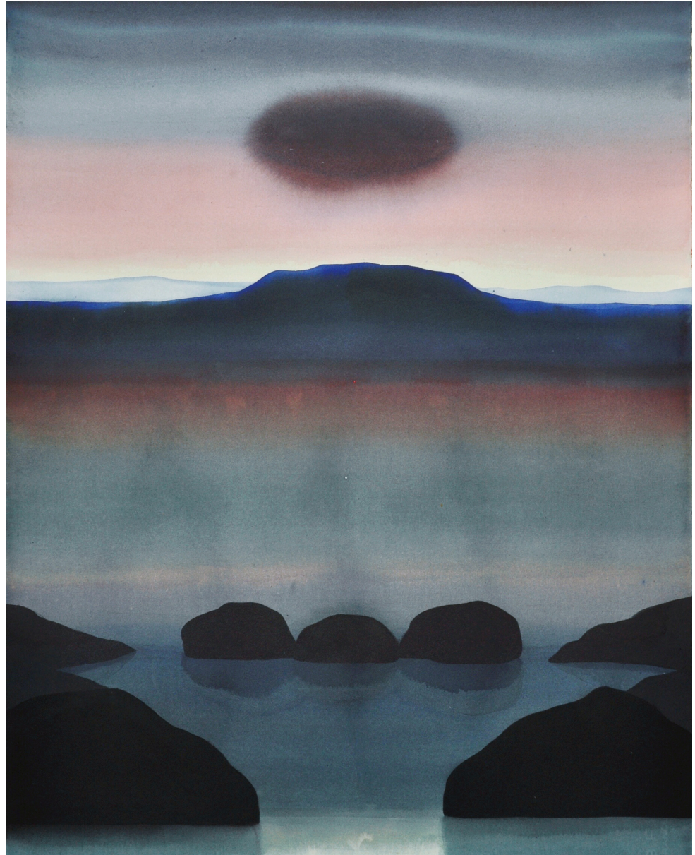
Rochers noirs , 76 x 56 cm, ink on paper, 2022

24 rue des Grands Augustins 75006 PARIS +33 (0)1 71 97 69 57 contact@galerie-insula.com www.galerie-insula.com mercredi - samedi 14h-19h30