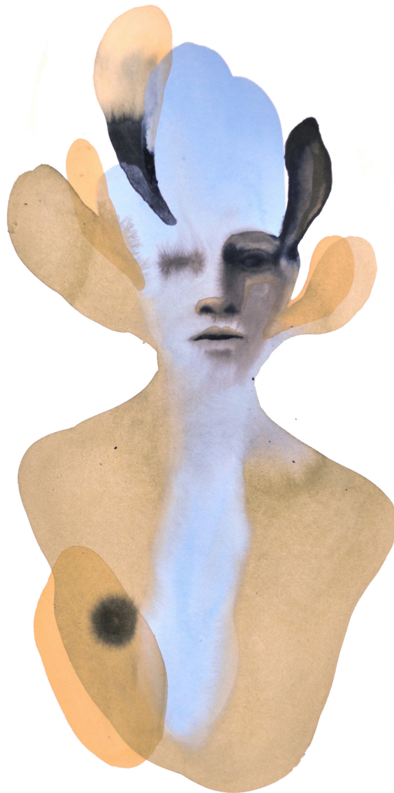
Adolescence , 50 x 35 cm, ink on paper, 2022

The images that Magali Cazo shares have the strength and transparency of which our memories and dreams are made. They are created, as if by magic, from the stroke of a brush dipped in a light ink that slowly diffuses into the paper to make forgotten landscapes or beings bloom with an enigmatic softness. With the discreet persistence of dreamlike visions, they permeate our gaze and delicately and deeply imbue our imagination with their silent beauty.