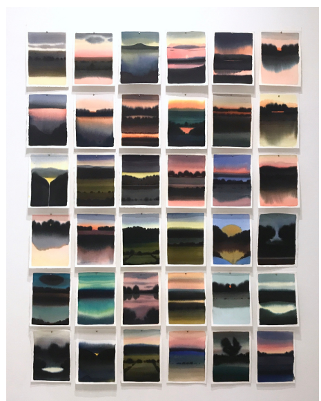
accrochage petits formats 19 x 14 cm, ink on paper, 2022