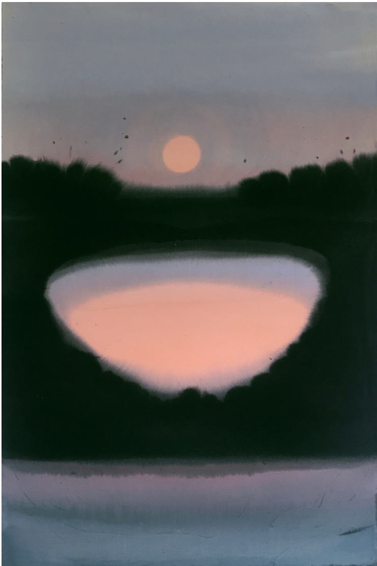
Baigner dans le rose , 120 x 80 cm, ink on paper, 2022