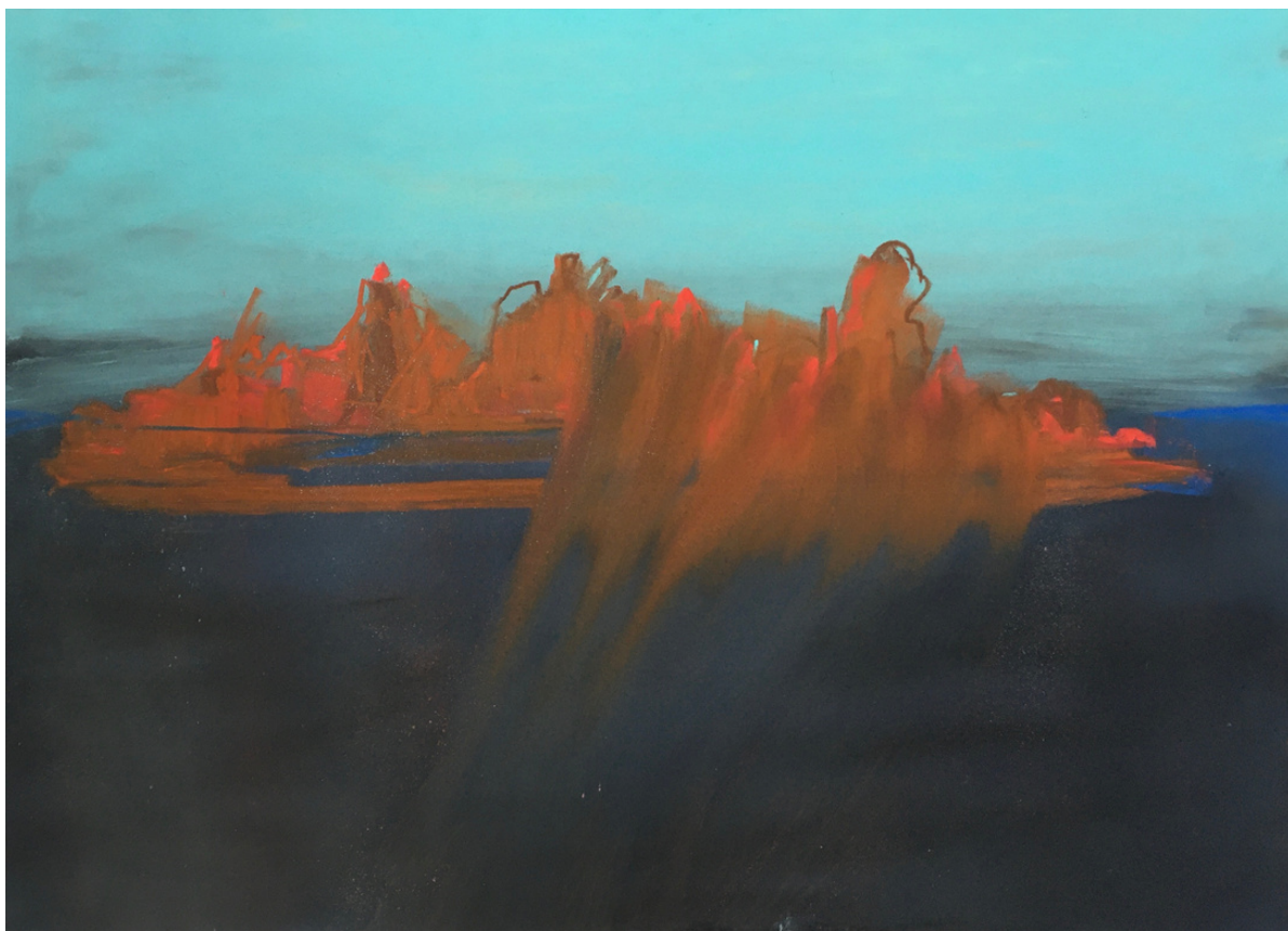
L'île 1 , pastel, 30 x 40 cm, 2021