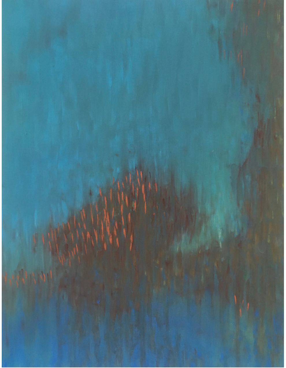
Le rocher 5 , Pastel, 40 x 30 cm, 2021