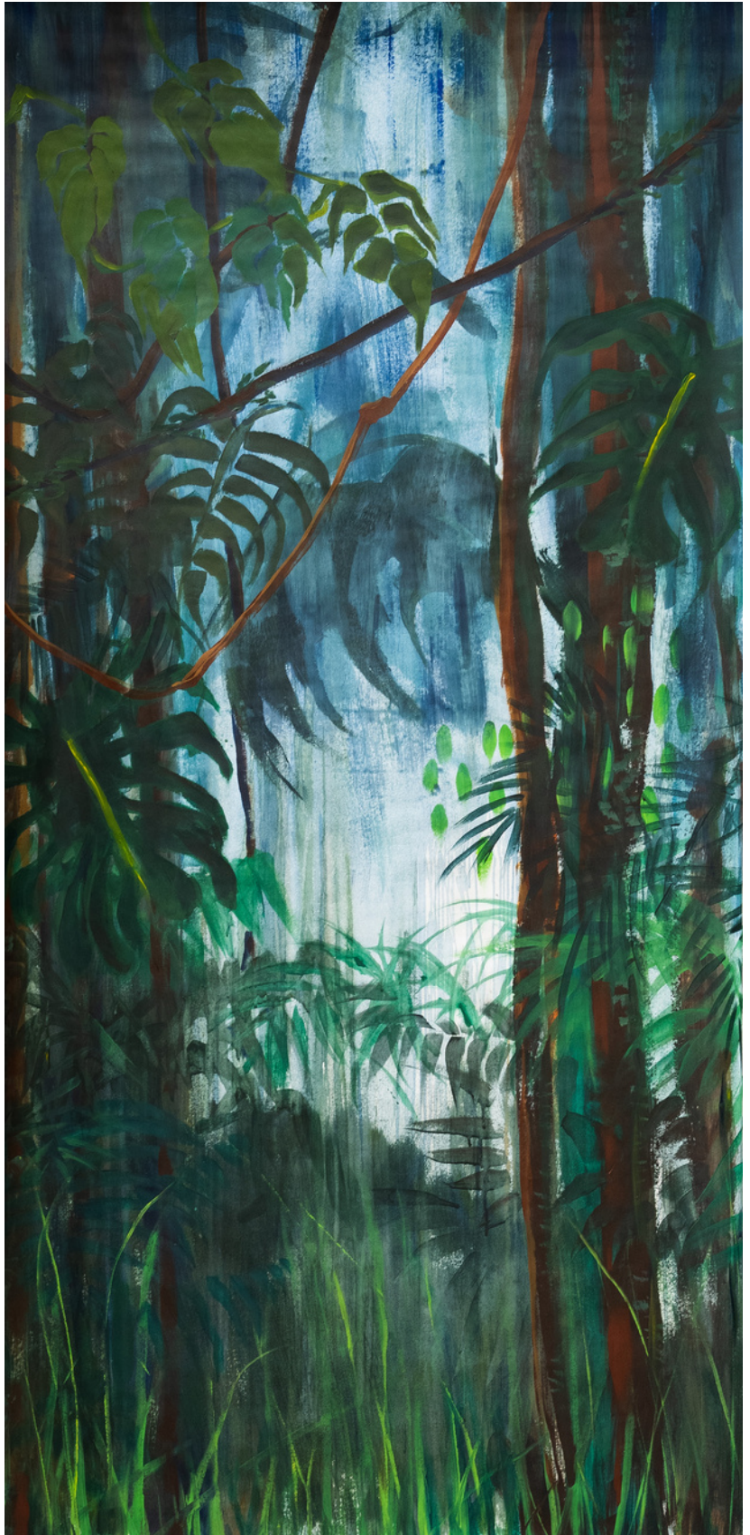
Jungle 2, acrylic on paper, 200 x 100 cm, 2021